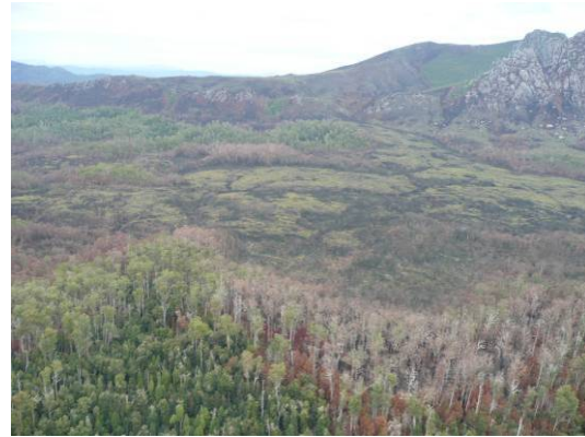
Area recovering from past fire incident