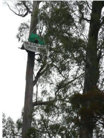
Volunteers perched on trees