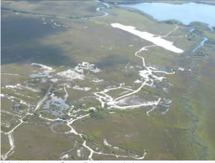
Melaleuca Cox Bight mining area