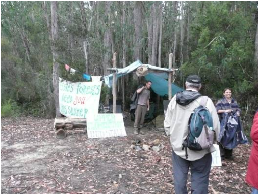
NGO protest site against logging