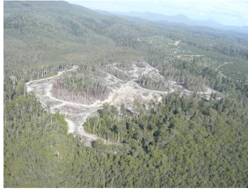
Variable retention logging system