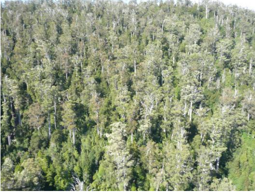
View of tall eucalyptus forest