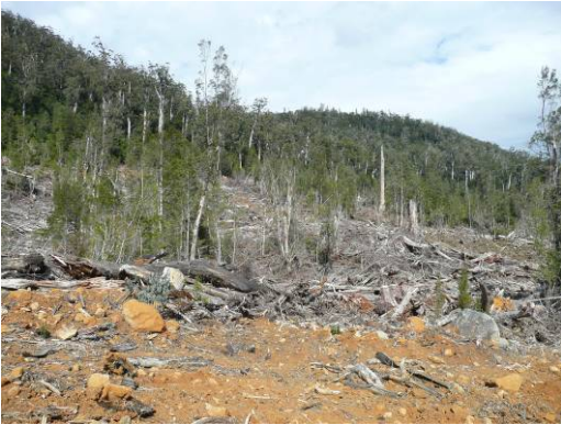
Logging coupe adjacent to the property